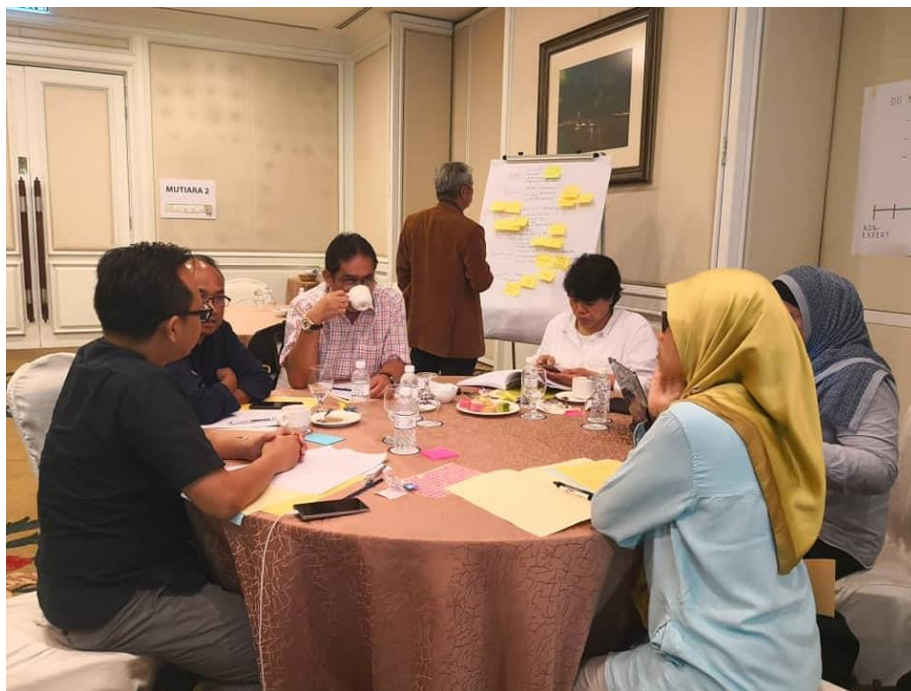
Fig. 2. The post-it-notes intervention.