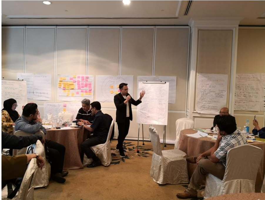
Fig. 1. The presentation from each group.

have the advantage of allowing participants to argue on the responses from other members in the group. In this stage, the moderator will ensure the member checking was conducted post-discussion to avoid misunderstandings among the participants and to reaffirm their decision. The post-it notes help to ease the process of transcribing the lengthy process of transcribing, and the process of coding can be expedited through the post-it notes intervention (Fig. 2).