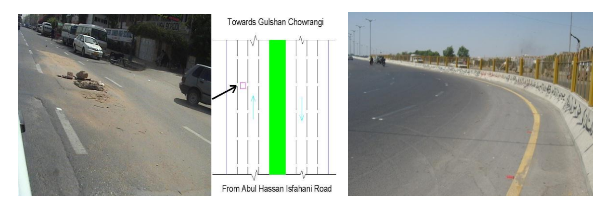
Fig. 1. Open manholes on busy collectors (left) and sharp horizontal curves with no safety measures (right).

Alost more than 15 arterials or major locations of respective towns are surveyed during the whole research in order to achieve all road and safety parameters. For illustration, the idea is visualized through the following figures.